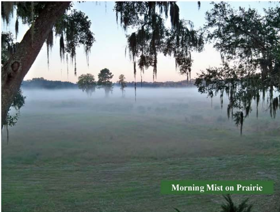
Morning Mist on Prairie